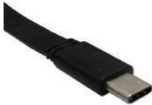
Type C 24M ( HOST)