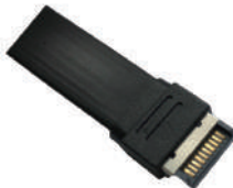
Key A 20M