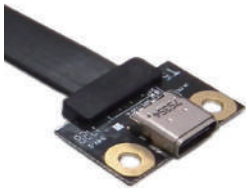
3.1C 24F C24M R/A