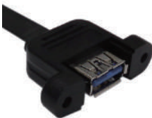
U3 A9F with EAR