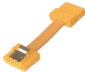
SATA Cable, Yellow,MOQ 10K