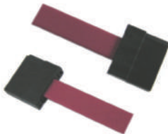
SATA Cable(no latch)