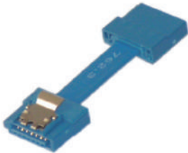
SATA Cable, Blue, MOQ 10K