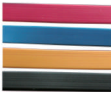
SATA cable, 4 colors

Halogen-Free SATA connector, IDC type (with latch / no latch ,4 colors)