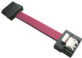
Slim SATA Cable