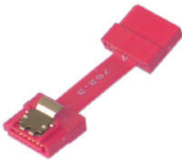
SATA Cable, Red, MOQ 10K