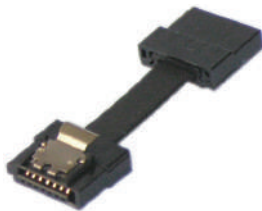
SATA Cable, Black