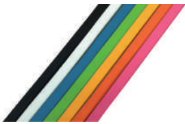
multi-color USB 4C flat cable 1.22*4.0mm