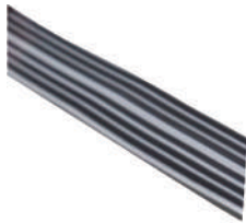
24G Hz support. 20C Black/White T=0.7mm 30AWG Laminated Cable