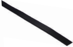
30AWG 19C, P0.5mm