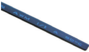
30AWG 7C, 4*1.2mm