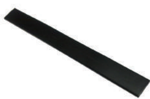
for HDMI/DP/PCIE/SAS up to 7.5GHz 13.2*1.4mm