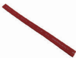
SATA2, solid, 28 AWG