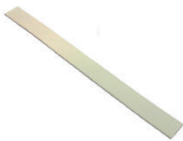
USB2.0 printable PE, 11.5*1.65mm