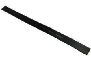
USB3.0 10C, up to 5G Hz, 1.25*8.4mm